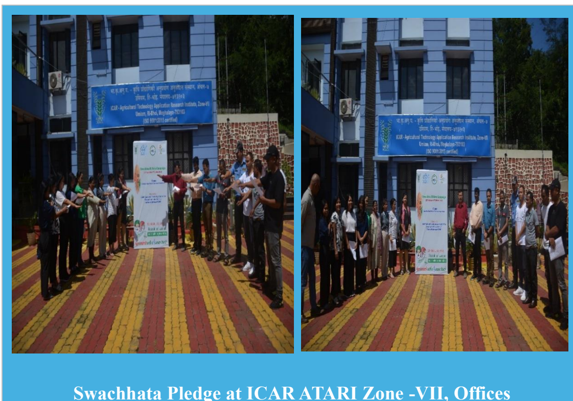
Swachhata Pledge at ICAR ATARI Zone -VII, Offices

On 15th September 2024, a Swachhta Pledge ceremony was organized by ICAR ATARI Zone-VII Umiam as part of the national initiative Swachhta Hi Seva 2024. The event saw active participation from the Nodal Officer, senior staff, and contractual employees of the organization. The pledge, aimed at promoting cleanliness and hygiene, was taken with great enthusiasm and commitment to the cause of cleanliness in the workplace and community. By participating in this pledge, the attendees reaffirmed their commitment to the principles of maintaining cleanliness in their surroundings, both professionally and personally. During the ceremony, the Nodal Officer, along with the senior and contractual staff, took the lead in reciting the Swachhta Pledge, encouraging all present to actively engage in maintaining cleanliness.