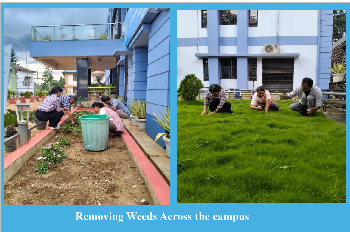
Removing Weeds Across the campus