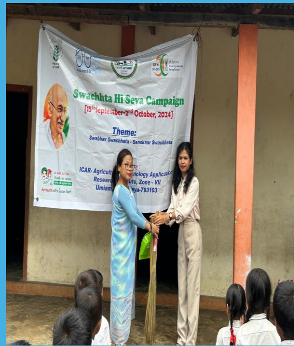
Distribution of dustbins in public places