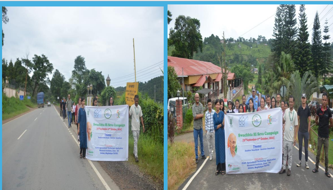
Walkathons at ATARI, Umiam