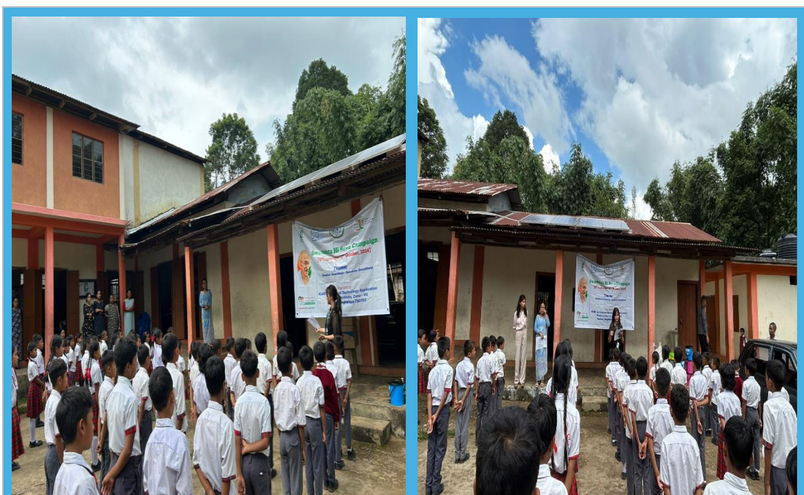
Awareness Programme on cleanliness at Umroi

On 29th September 2024, ICAR ATARI Zone-VII organized an awareness program on cleanliness (Swachhta) at the Upper Primary School. The purpose of this event was to engage with the students and raise awareness about the importance of cleanliness. The program aimed to educate the students on the significance of maintaining a clean and hygienic environment, both at school and at home. During the event, interactive sessions were held to highlight various aspects of cleanliness, including waste management, personal hygiene, and the impact of a clean environment on health and well-being. The students were encouraged to adopt good cleanliness practices and take responsibility for keeping their surroundings clean.