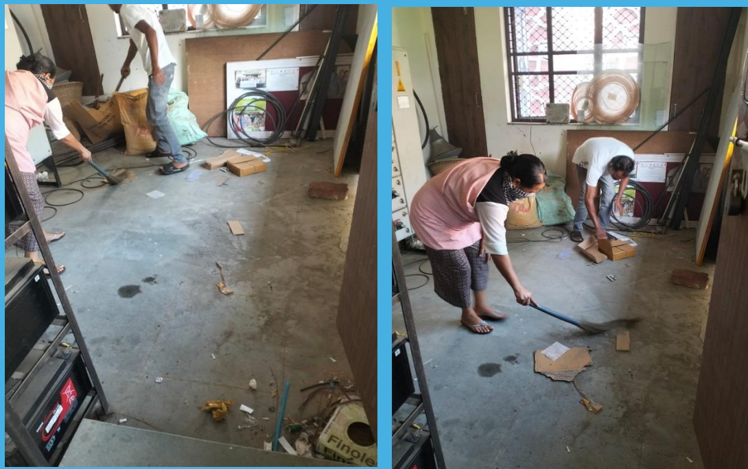
Timebound transformation of difficult and dirty spots

On 24th September 2024, ICAR ATARI Zone VII, Umiam organized a cleanliness drive as part of the Swachhta Campaign, focusing on the timebound transformation of difficult and dirty spots within the office premises. The drive targeted areas that were difficult to clean due to their location or nature, such as neglected corners, high-traffic zones, and hidden spaces prone to accumulating waste. The aim was to efficiently clean and restore these spots to a hygienic state within a short period, enhancing the overall cleanliness and aesthetic value of the office.