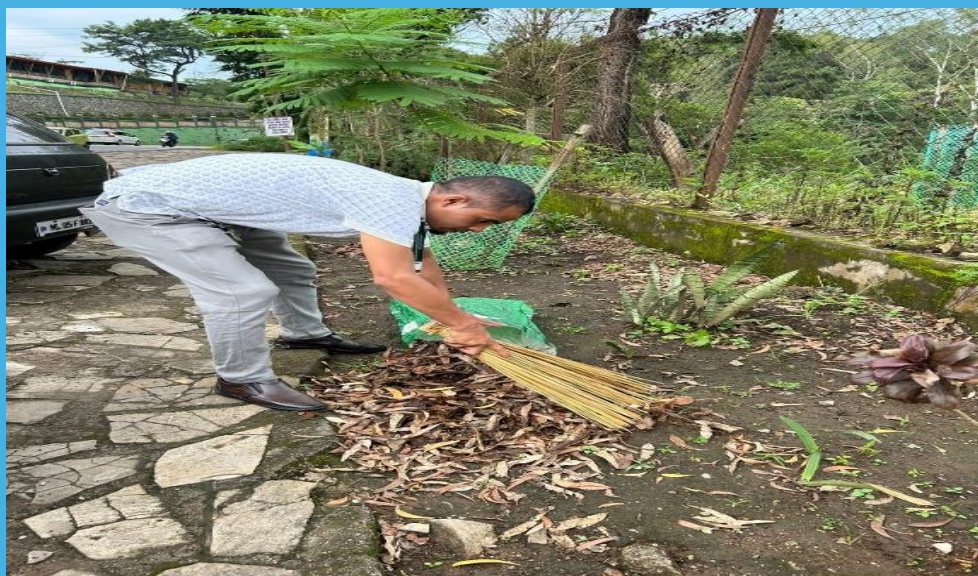
Reduce, Reuse, activities

On 21st September 2024, ATARI Zone VII, Umiam organized cleanliness drives aimed at reducing and reusing waste materials, such as plastics to promote the Swachhta (Cleanliness) campaign. These drives focused on cleaning public spaces and encouraging the community to adopt sustainable practices for maintaining a cleaner environment. Additionally, the initiative emphasized promoting cleanliness within the office premises, encouraging staff and the public to contribute to the Swachh Bharat Mission by showcasing efforts to maintain a hygienic and eco-friendly environment.