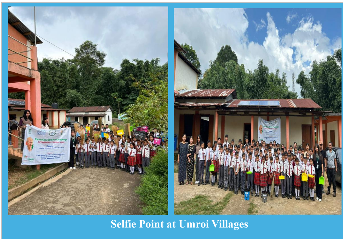
Selfie Point at Umroi Villages