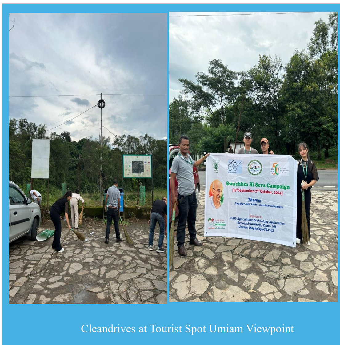
Cleandrides at Tourist Spot Umiam Viewpoint

On 23rd September 2024, ICAR ATARI Zone VII organized a cleanliness drive at the Umiam Viewpoint, a prominent tourist spot in the region. The initiative focused on cleaning the area, ensuring that the viewpoint remained beautiful and accessible for visitors. The drive aimed to raise awareness about the importance of environmental sustainability, responsible tourism, and waste management. By engaging the local community and visitors, the event promoted collective action to maintain cleaner, greener public spaces and encouraged everyone to contribute to preserving the natural beauty of the area for future generations.