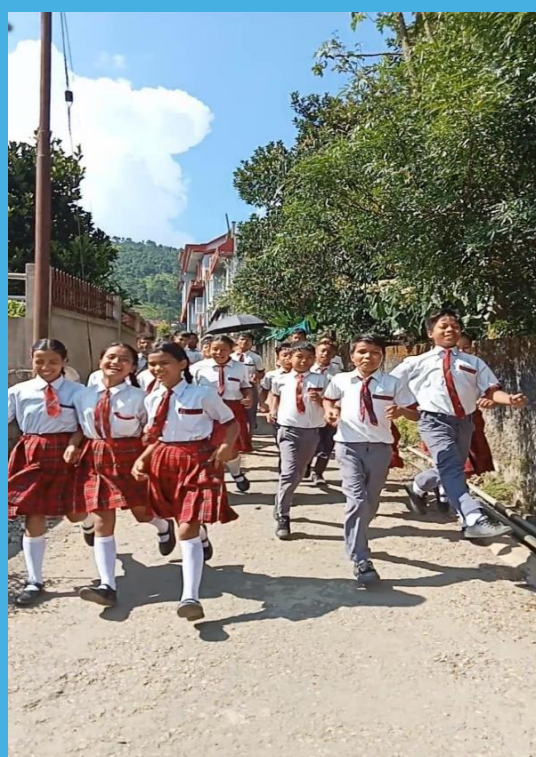
Swachhta Runs at Upper Primary School, Umroi Madan