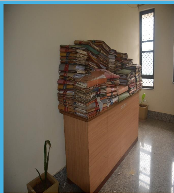
Weeding out old files at Office