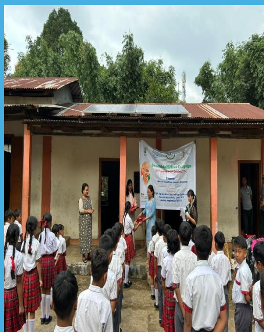
Painting & Essay competition at Upper Primary School, Umroi Madan